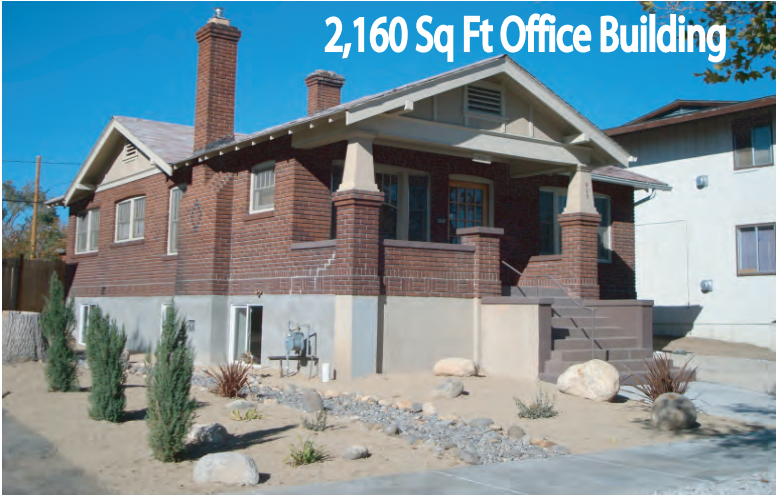
2,160 Sq Ft Office Building